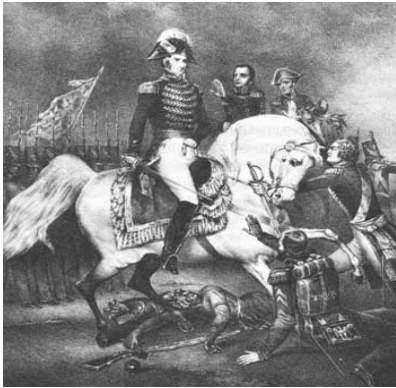
Gen. William Henry Harrison, Gov. of NW Territory