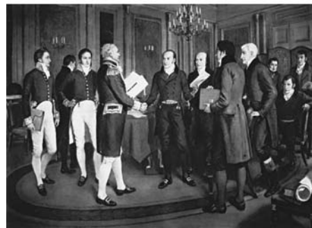
Treaty of Ghent