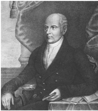
John Quincy Adams