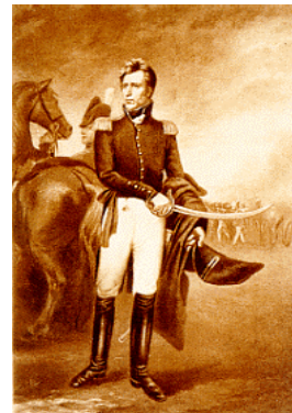
Andrew “Old Hickory” Jackson