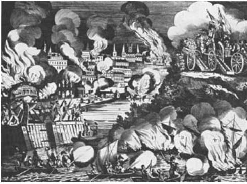
Burning of Washington D.C. (Oct. 24, 1814)