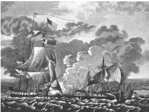
Battle of Lake Erie