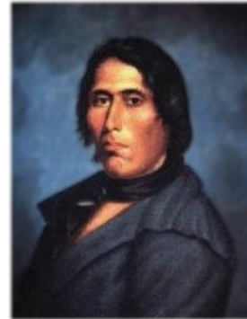
Shawnee Chief Tecumseh